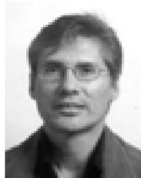
Matthew Coon Come, National Chief of the Assembly of First Nations graciously accepted an invitation to be the key note speaker at our event.

The First Nations Child & Family Caring Society of Canada Inc. (FNCFCSC) and the Centre of Excellence for Child Welfare (CECW) held its grand opening of the First Nations Research Site located at the University of Manitoba, Faculty of Social Work on Tuesday, February 5th, 2002.