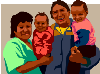
First Nations child and family service research, conduct