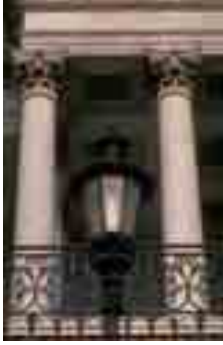
Faculty of Social Work, University of Manitoba - new home of the First Nations Research Site.